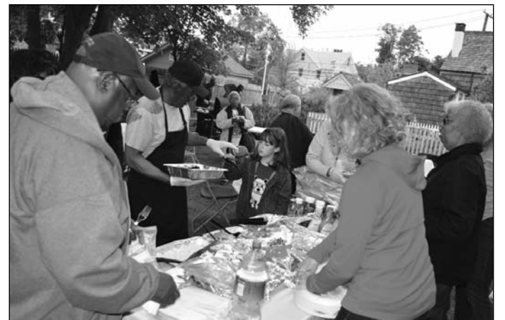
Enjoying the picnic after the tour.

To make a donation to help restore the historic Pine Hollow Cemetery please send checks to the Hood A.M.E. Church Pine Hollow Cemetery Restoration, 137 South Street, Oyster Bay, NY 11771